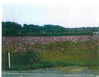
(Cosmos covering the field where nobody can live yet)