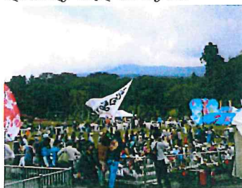
(People enjoyed their traditional Fishermen's Feast)